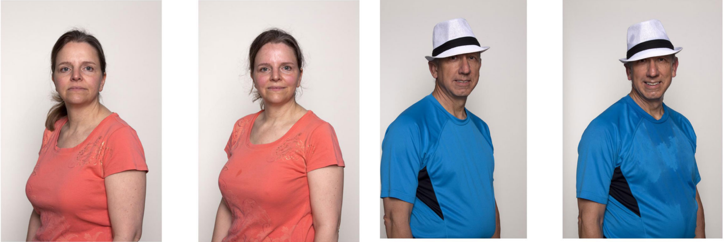
Still in Motion 8 panels 42"x 36" each 2012