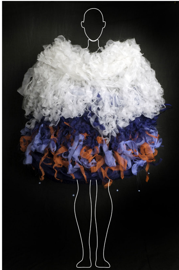
Whisperdress Silk Organza, polyester fabric Glass Beads 36"x36"x30" 2021